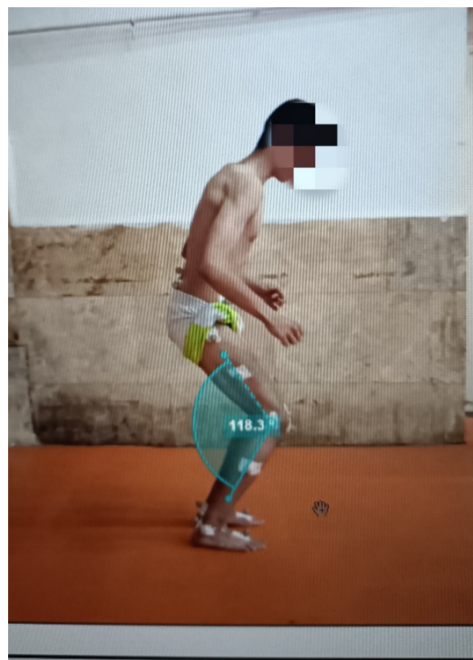
Figure 2. Knee angle in the sagittal plane at the moment of landing