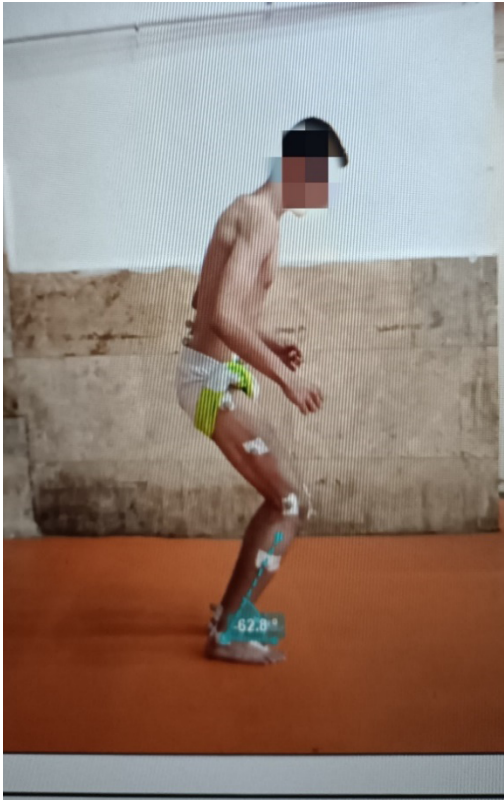
Figure 3. Ankle angle in the sagittal plane at the moment of landing