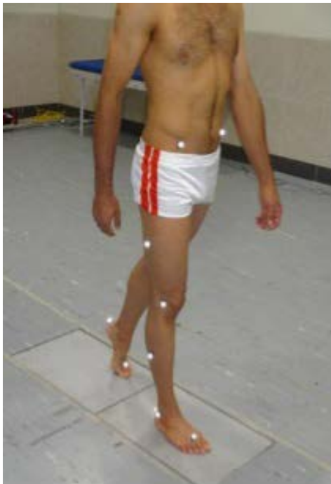
Figure 1. Marker placement