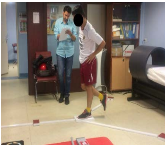
Figure 5. Y-Balance Test PHYSICAL TREATMENTS

The Y-Balance Test is done in three directions of anterior, posteromedial and posterolateral. The subject stands on a single leg in the center of Y and tries to reach the opposite limb while maintaining the balance. He/she touches the furthest possible point by toe in any of directions without error (Figure 5). The distance from the contact point to the center is the distance to be reached which is recorded in cm. Since this test has a significant association with leg length, in order to perform this test and normalize the data, before starting to record, the actual length of the leg was measured by a tape meter from