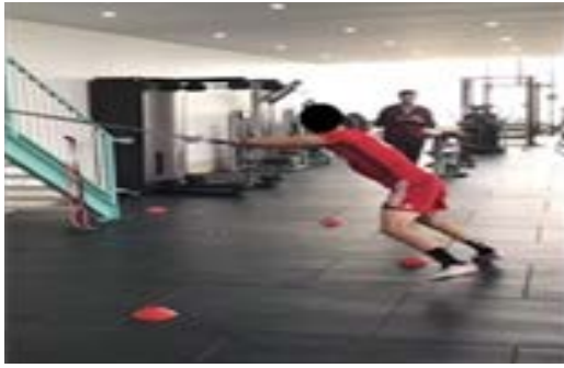
Figure 3. Co-Contraction Test PHYSICAL TREATMENTS