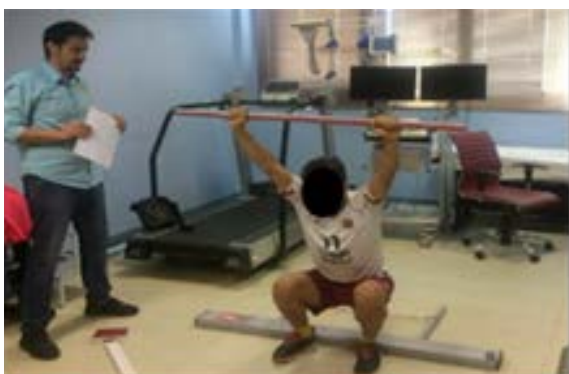
Figure 1. FMS

The Functional Movement Screen tests (Figure 1) consist of seven movement tests which are able to detect limits and changes in normal movement patterns. This test was designed to provide interaction between movement chain and the necessary sustainability to implement functional movement patterns. In this test, the seven movement were scored from 1-3 points; if they done properly and without compensation, the subject earns 3 points; if done with some compensatory movements, the given score is 2; and if the subjects could not complete