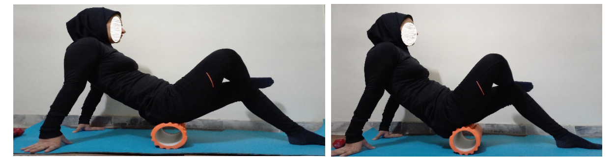
Figure 7. Release of gluteal muscles