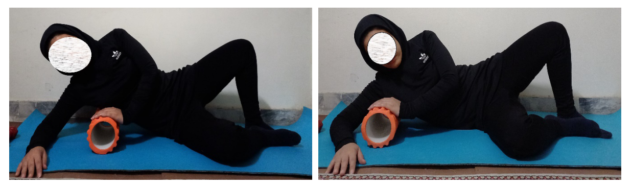
Figure 1. Releasing the latissimus dorsi muscle with a foam roller