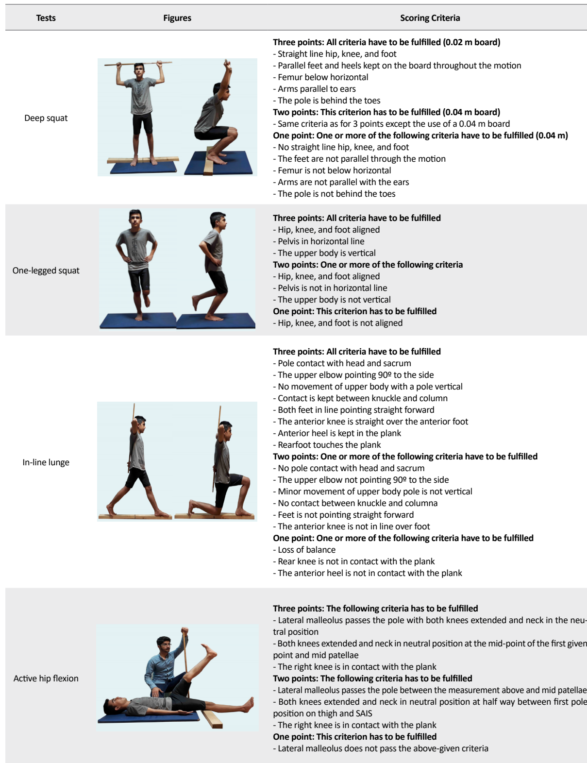
Table 1. Scoring instructions for Nine-test Screening Battery (9TSB)