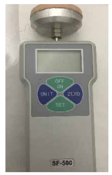
PHYSICAL TREAT MENTS

The subjects were asked to keep a maximum voluntary contraction for 5 seconds. Each contraction was repeated three times with 30 seconds rest between each try [13-15]. In this study, the muscles are not usually tested individually and other muscles are involved [15]. For example, various studies have shown increased activity of the medial trapezius muscle during the lower trape-