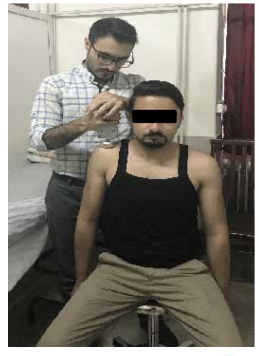
PHYSICAL TREA TMENTS

To measure the maximum isometric strength of the external and internal rotators, the subject was placed in a prone position, bent his elbow 90 degrees, place the shoulders in a 90 degrees abduction and hang the limbs off from the bed, with a folded towel under the shoulder. The handheld dynamometer was placed in the dorsal surface of the hand (above the wrist joint) for external rotation and in the anterior surface of the hand (above the wrist joint) for internal rotation. The subject applied pressure to the external rotation and the examiner towards the internal. The subject was asked to apply maximum pressure on the dynamometer in the directions of