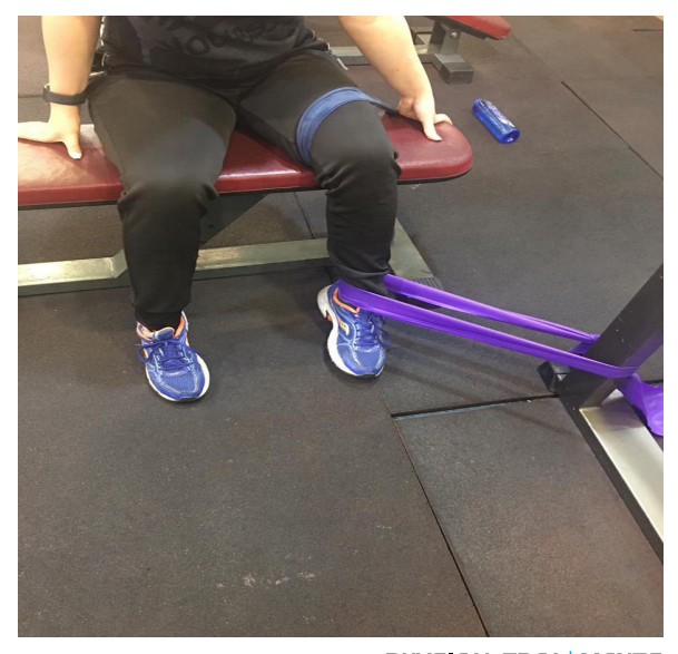
PHYSICAL TREAT MENTS Figure 2. External isometric strength test of the hip rotator cuff

External strengthening exercises of the rotator of the hip joint muscles were performed in a sitting position. First, the elongation was determined by measuring the distance between the axis of movement of the external