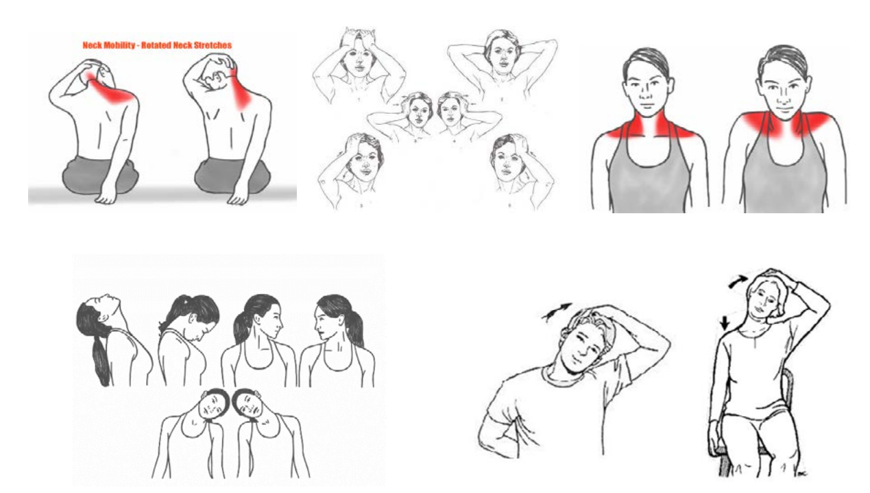
Figure 4. Prescribed exercises for neck

was held over spinous processes of thoracic vertebrae so that arm was perpendicular to ground, while the movable arm was aligned with dorsal midline of head. The reference point was the occipital protuberance (Figure 2).