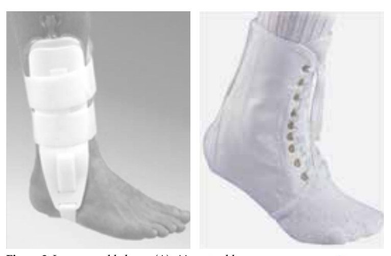
Figure 2. Lace-up ankle brace (A), Aircast ankle PHYSICAL TREA MENTS brace (B).

[22]. In normal condition the excitation signal to muscle contraction is very rapid and an adequate number of motor units are recruited. After initiation of muscle contraction, less motor units are needed for maintaining contraction; however, in fatigue condition the excitation is slow and less motor units are recruited resulting in less muscle contraction. Because brace application helps motor unit recruitment, ankle bracing might be able in recruiting mechanoreceptors that can use motor units even in fatigue condition, which results in improved dynamic postural control.