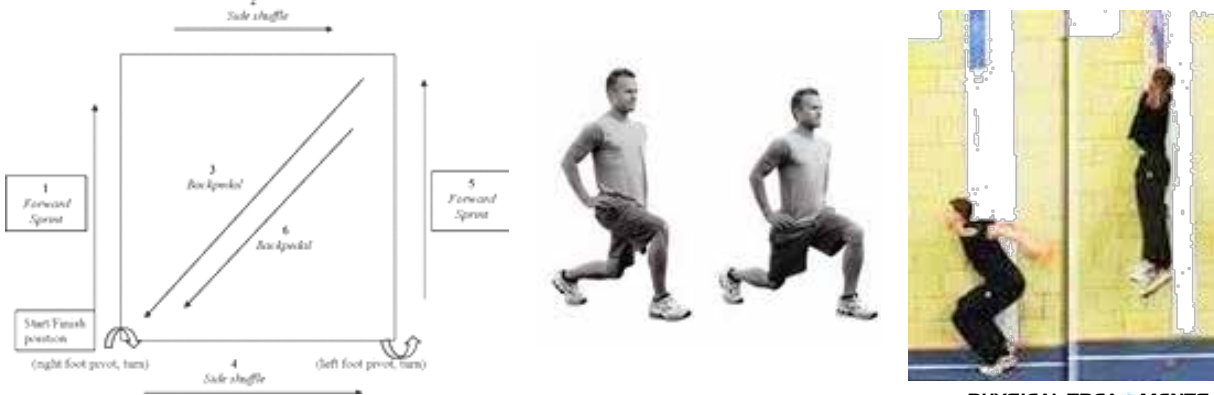
PHYSICAL TREA MENTS

The results of the present study are in agreement with this point. Higher efficiency of lace-up bracing might be due to more afferent messages sent to the central nervous system by skin mechanoreceptors, as lace-up brace compared to Aircast brace covers a greater area and consequently might stimulate more mechanoreceptors resulting in increased afferent messages and amplitude of the peroneus longus reflex. Aircast brace cannot affect mechanoreceptors of skin as much as lace-up brace can (due to the smaller covered area) and for this reason it is less efficient than lace-up brace. Cordova et al. in their study on the amplitude of peroneus longus muscle during brace application, showed that in short-term application (once), the excitatory force of muscle reflex in lace-up bracing is higher compared to semi-rigid bracing, but in long term (8 weeks) excitatory force of muscular reflex is higher in case of Aircast bracing while lace-up bracing has no significant improving effect [23].