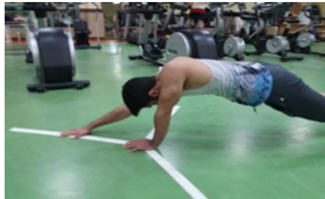
Figure 1. Upper quarter Y-balance test

To assess the upper extremity function, the upper quarter Y-balance test was used and white paper labels similar to the Y-balance device were glued to the ground. Gorman et al. (2012) reported the validity of the upper quarter Y-balance test upper extremity function test in intra-rater correlation coefficient (ICC=0.99-0.80) and inter-rater correlation coefficient (ICC=0.90) [15].