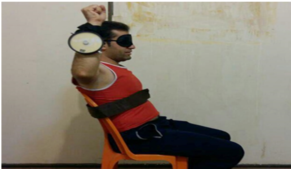
Figure 1. Measurement, internal rotation, and external rotation

The sling exercises were performed for 8 weeks, 3 sessions per week, each lasting one hour. These exercises were also prepared based on previous studies [15-29]. Each exercise session included a 10-minute warm-up, a 45-minute main exercise, and a 5-minute cool-down. The suspension exercises program was also selected based on previous studies and performed on the TRX tool. In performing the suspension exercises, it was tried