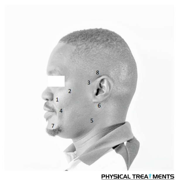
Figure 2. Low-level Laser Therapy (LLLT) application points (in order of treatment)

The face is considered to be a functionally and emotionally important part of the human body due to its profound impact on self-concept and aesthetics [19]. BP is a com-