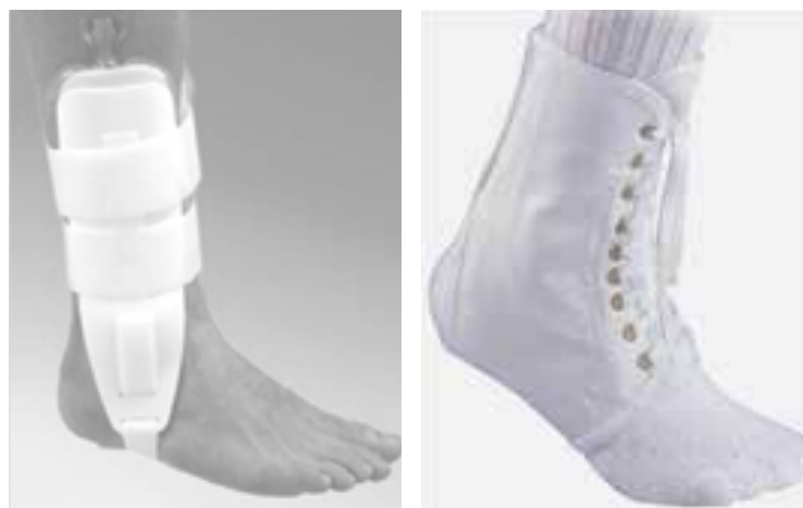
Figure 2. Lace-up ankle brace (A), Aircast ankle brace (B). PHYSICAL TREATMENTS

[22]. In normal condition the excitation signal to muscle contraction is very rapid and an adequate number of motor units are recruited. After initiation of muscle contraction, less motor units are needed for maintaining contraction; however, in fatigue condition the excitation is slow and less motor units are recruited resulting in less muscle contraction. Because brace application helps motor unit recruitment, ankle bracing might be able in recruiting mechanoreceptors that can use motor units even in fatigue condition, which results in improved dynamic postural control.