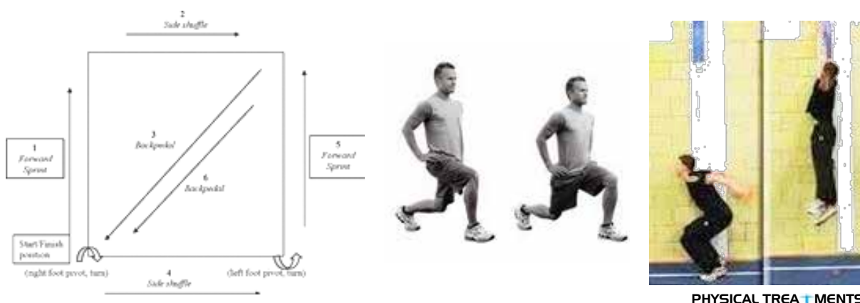
Figure 3. The functional fatigue protocol comprised 3 stations. A: Modified Southeast Missouri (SEMO) agility drill [12], B: Stationary lunges, C: Quick jumps. First modified SEMO agility drill was performed, immediately after that lunge movement was performed 5 times by each leg. Finally, there was vertical jump station that included 10 fast jumps equal to 50% of the subject's maximal jump height. After performing 3 consecutive stations, one cycle was completed and the subject immediately returned to the starting point to begin the new cycle and repeated cycles until achieving fatigue [12]. PHYSICAL TREATMENTS

The results of the present study are in agreement with this point. Higher efficiency of lace-up bracing might be due to more afferent messages sent to the central nervous system by skin mechanoreceptors, as lace-up brace compared to Aircast brace covers a greater area and consequently might stimulate more mechanoreceptors resulting in increased afferent messages and amplitude of the peroneus longus reflex. Aircast brace cannot affect mechanoreceptors of skin as much as lace-up brace can (due to the smaller covered area) and for this reason it is less efficient than lace-up brace. Cordova et al. in their study on the amplitude of peroneus longus muscle during brace application, showed that in short-term application (once), the excitatory force of muscle reflex in lace-up bracing is higher compared to semi-rigid bracing, but in long term (8 weeks) excitatory force of muscular reflex is higher in case of Aircast bracing while lace-up bracing has no significant improving effect [23].